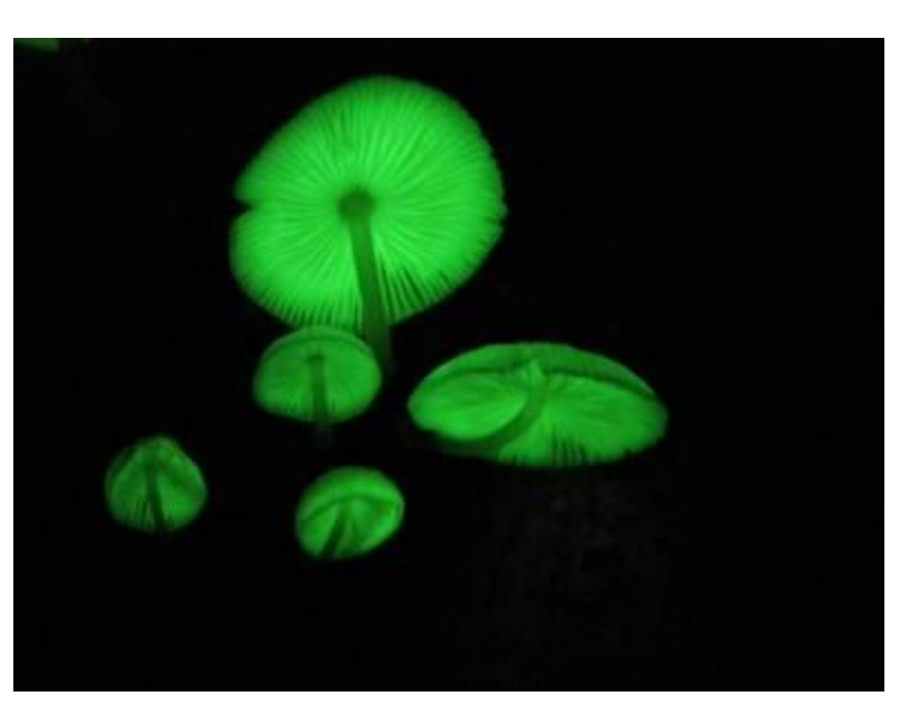
Luminous Mushroom Mycena lampadis

Toni (80 Mt Gravatt Road) has now partnered with neighbours and hired a contractor to clear invasive weeds from their side of Firefly