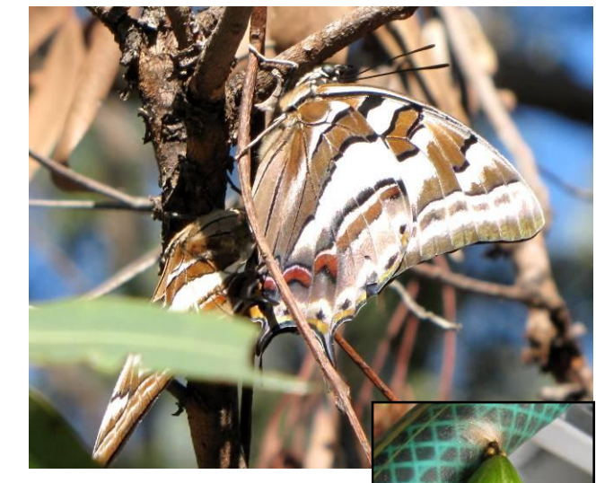
Tailed Emperor Polyura sempronius Chrysalis found after 2011 Gully Day

The 2011 Community Gully Day removed six cubic metres of rubbish and followed up removal of the Indian Rubber tree with removal of a large number of Yellow Oleander (Captain Cook) trees. Since then logs have been put in place and the slope mulched to control erosion and prepare the soil for replanting.