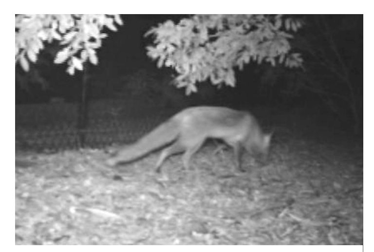
18/6/12 4:27am Fox arrives and goes to raid hen house