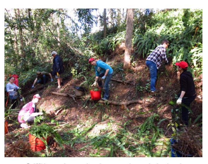
Griffith students clearing weeds and placing logs

The main focus this year has been clearing the Fishbone Fern and bamboo at the top of Fox Gully, maintenance work on past plantings and reducing silt being washed into the gully in heavy rain.