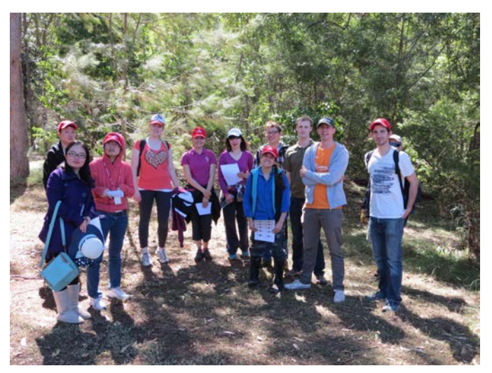
Happy team proud of their achievement

Leading a walk in Toohey Forest during O'Week, showing students Koala scratches on trees and finding a native bee hive in a log, was a success. We now have a core group of students working at Fox Gully and our Mt Gravatt SHS sites.