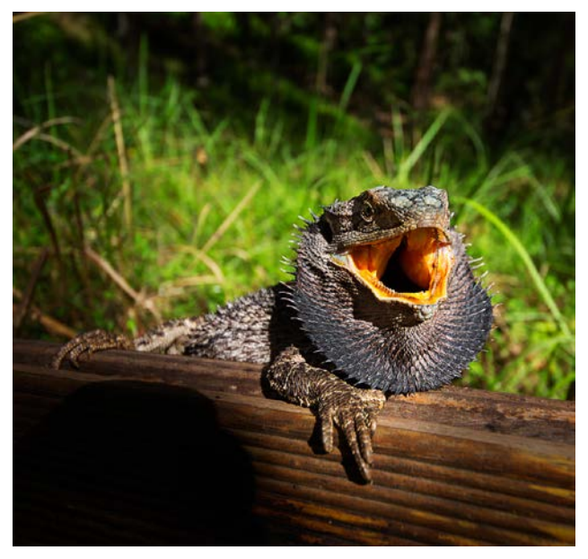
Eastern Bearded Dragon Pogona barbata

First cover the basics of digital photography – shutter vs aperture priority, macro vs telephoto and depth of field, getting focus right. Then join Alan, on assignment in the bush, to practice your new skills. Return from assignment for