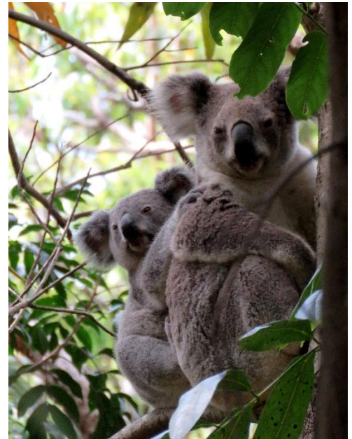
Koala Mum & Joey Phascolarctos cinereus

The Reserve, a remnant of once extensive bushland, now protects rare plant and animal species that, just 150 years ago, were widespread.