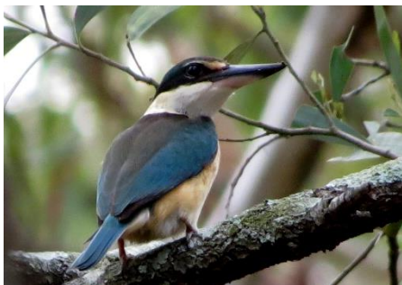
Sacred Kingfisher Todiramphus sanctus

Second Sunday of each month: 8.30 – 10.30 am Contact Liz - rolychapmanreserve@gmail.com