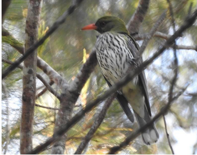
Oriolidae Sphecotheres viridis Figbird