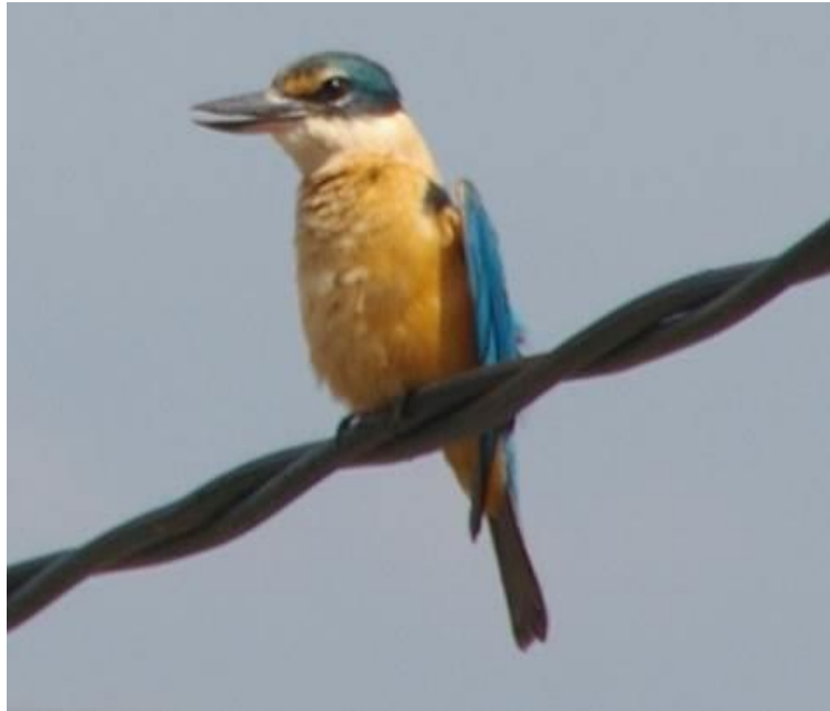
Halcyonidae Todiramphus sanctus Sacred Kingfisher