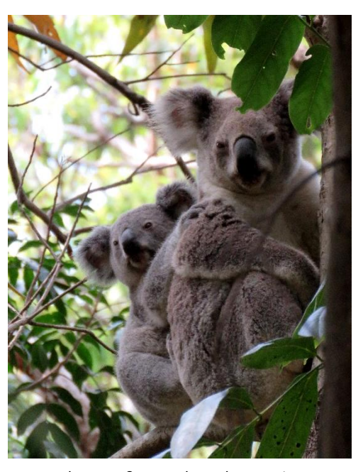
Koala Mum & Joey Phascolarctos cinereus