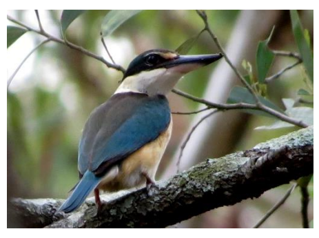
Sacred Kingfisher Todiramphus sanctus

Second Sunday of each month: 8.30 – 10.30 am Contact Liz - rolychapmanreserve@gmail.com